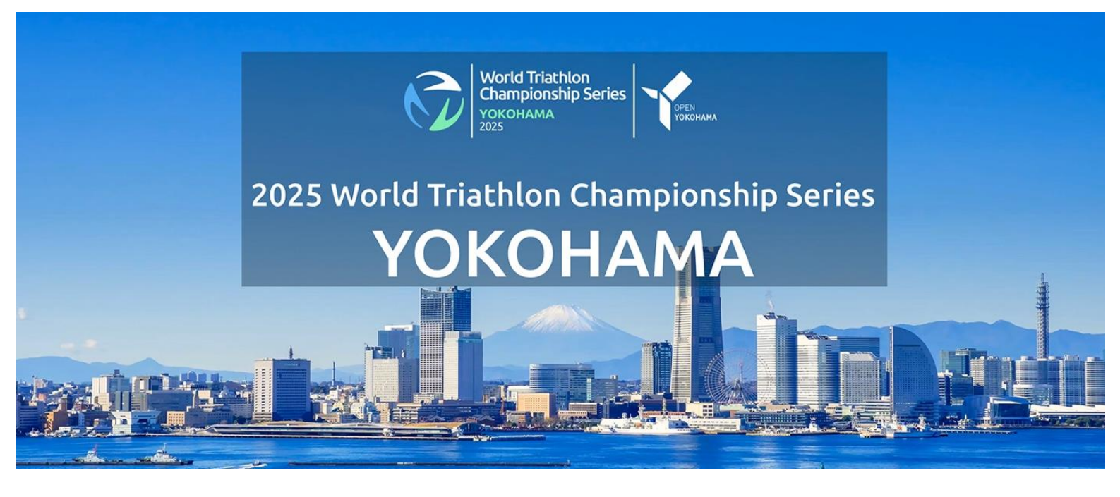
TO Newsletter # 1 – 28 March, 2025

Konnichiwa – こんにちは and Hello to everyone!